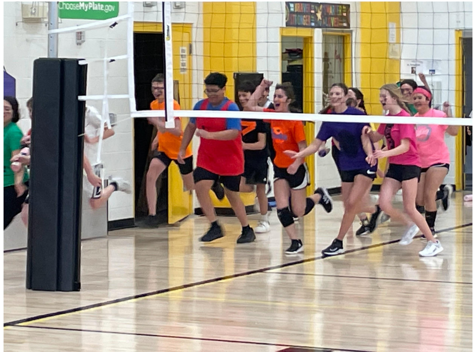
The eighth graders take the court with enthusiasm at the teachers vs. eighth grade volleyball game.

The last two years, the students have watched the game with their Faith Families instead of sitting with their class.