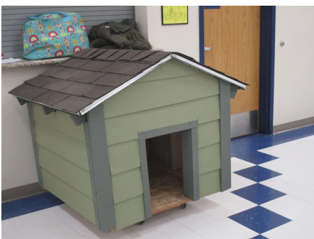
Mr. Blaschke's building elective constructed and donated a dog house.

split up into parts and given to different parts of the school. Once all the money is calculated, 10% goes to the Diocese, 45% goes to the school, 45% is given to the Church, and the remaining 10% goes to CYM.