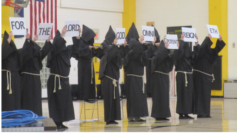
Teachers perform “Hallelujah” in monk attire.