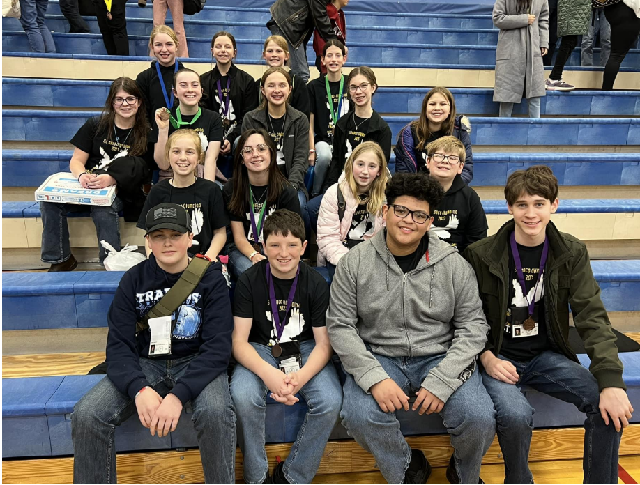
The Science Olympiad team poses after regionals. The team will compete in the state competition on April 1.